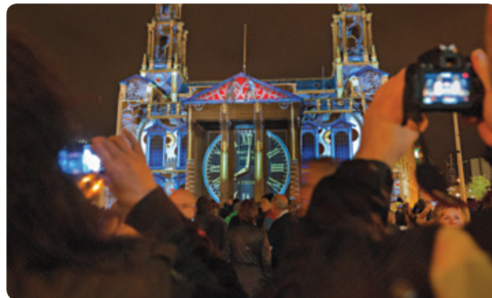
Momentous / Betty Lawless

Projection artists Illuminos were commissioned to transform the front of Leeds Civic Hall into a working Potts clock complete with cogs, gears, chimes, pulleys and automata figures. The projection was created from video footage of over 1200 Leeds people filmed in the summer. Momentous ran for three nights in October, forming the centrepiece for Light Night. Over 20,000 people came to see the projection light up Civic Hall and wait for the quarterly hour chimes. Our audience was truly intergenerational from babies to grandparents and everybody in the middle!