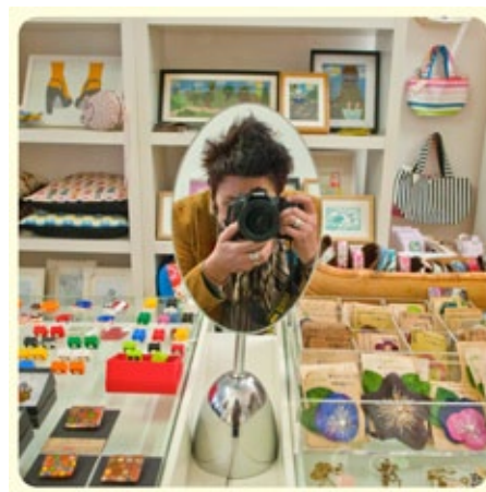
The Stalls Pop-Up Shop / Betty Lawless

Keep an eye out for... more beautiful photos of Leeds in 2013 from Betty: www.flickr.com/leedsinspired