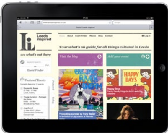
Leeds Inspired home page