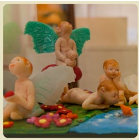
Love Arts Festival / Betty Lawless