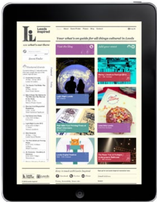
Leeds Inspired website

storytelling, film making, design workshops, play spaces, mobile museums, travelling sheds, music in the bus station, illustration, human powered cuckoo clocks, den building, vend art, pop-up print, childrens ballet, hackdays, radio plays, brand new theatre, music in the market, art on a barge, community festivals, comic books, street dance, playful signage, art by older people, Indian ragas, mini olympics, stories of Leeds