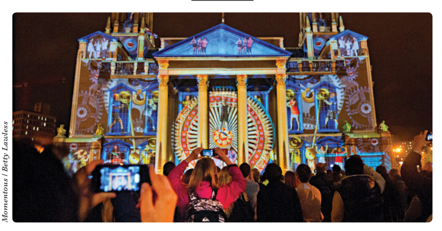
See what's out there

flash buskers, market stories, dancing in libraries, digital graffiti, inflatable play spaces, community choirs, experiments in electronica, breakdance battles, momentous projections, street corner poetry, carnival costumes, films about you and me, synchronised mermaids, creative grandparents, go-kart celebrations, playing out stories, organ music, hand painted stages, theatre on a bicycle, one hundred years of film, outdoor theatre, hair raising photography, bringing home the happy